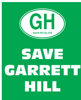
Flag 4 - Save GH