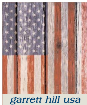
Flag 3- Patriotic GH