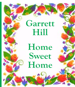
Flag 5 - Sweet Home