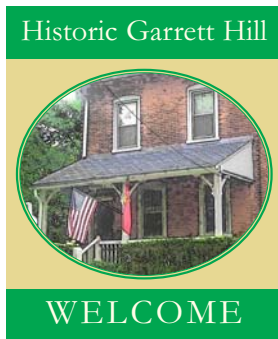
Flag 2 - House

Pick one to display today – and enjoy all Summer!