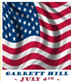
Flag 10-5 - GH July 4

YES! I want to share my pride in Garrett Hill ... Accept my donation to the GHC for my GH Cookbook or my custom GH Garden Flag