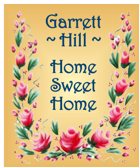
Flag 10-4 - GH Sweet Home