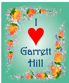
Flag 10-1 -Love GH