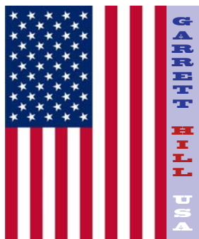
Flag 10-2 - Patriotic GH